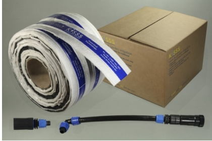
1 x 50m 2 Complete Kit