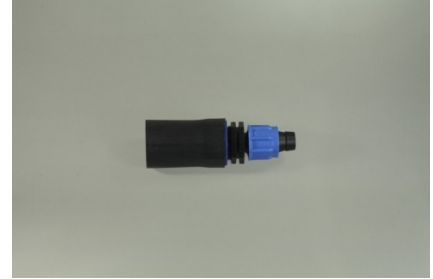
Auto-flushing valve (spinlock)