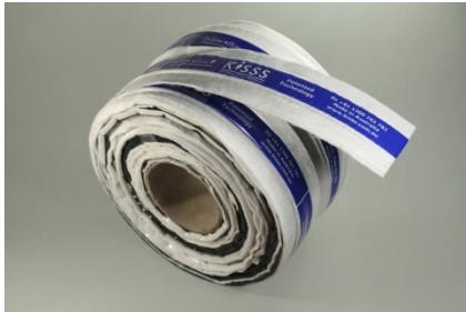
100m (325') x KISS in 1 x roll