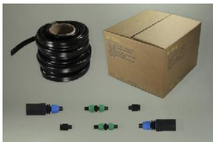
1 x Header Kit Large