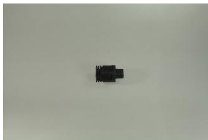
2 x End cap (spinlock)