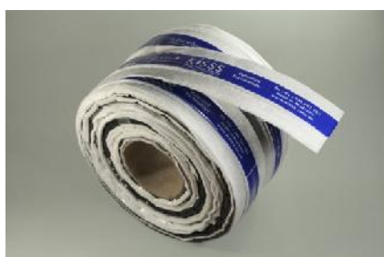
800m (2,600') x KISSS in 8 x rolls