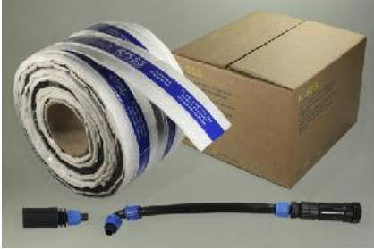
1 x 25m 2 Complete Kit