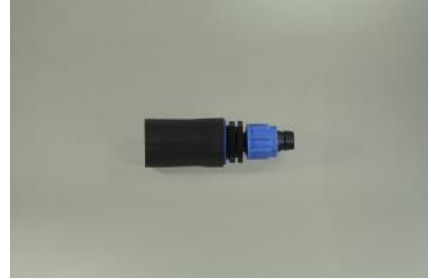
Auto-flushing valve (spinlock)