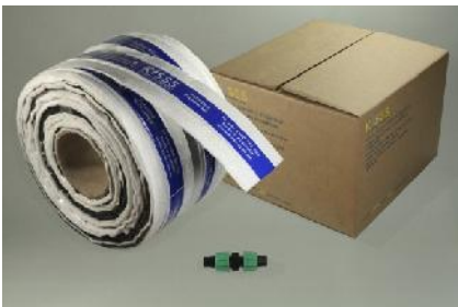
3 x 50m 2 Extension Kit