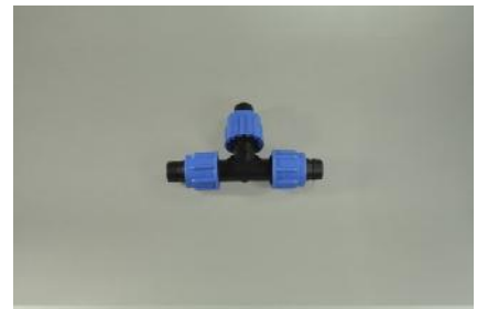
5 x Tee joiner (spinlock)