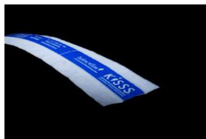
Install this way up.