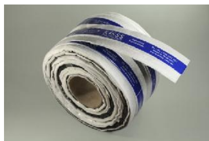
350m (1,135') x KISS in 4 x rolls