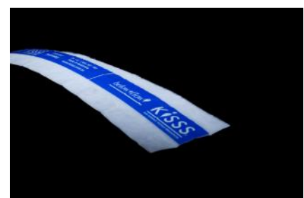
Install this way up.