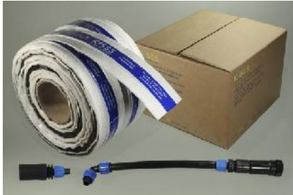
1 x 50m 2 Complete Kit