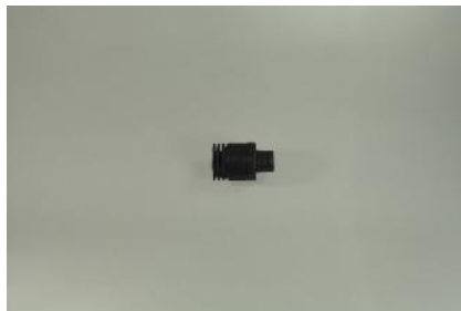
2 x End cap (spinlock)