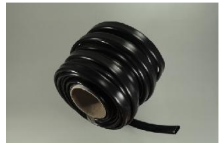
10m (30') Header pipe