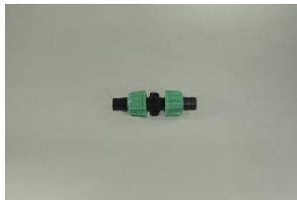
3 x Straight joiner (spinlock)